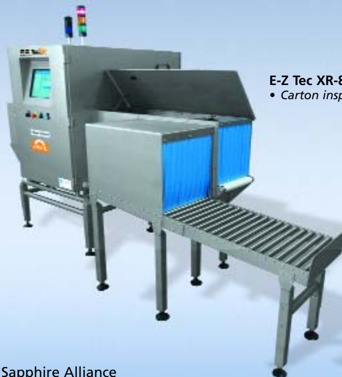
E-Z Tec XR-81 • Carton inspection

Note: Some safety warning labels or guarding may have been removed before photographing this equipment.