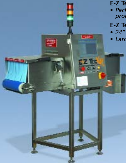
E-Z Tec XR-21 • Packaged and loose products up to 14" belt widths