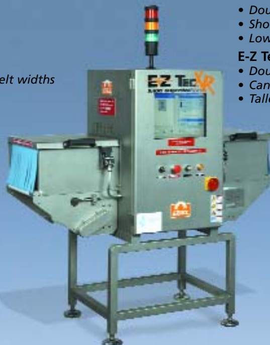
E-Z Tec XR-31 • Double beam • Short glass jars • Lower speed