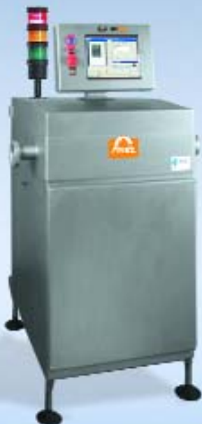
E-Z Tec XR-71 • Pipe line inspection with available reject valve • Washdown