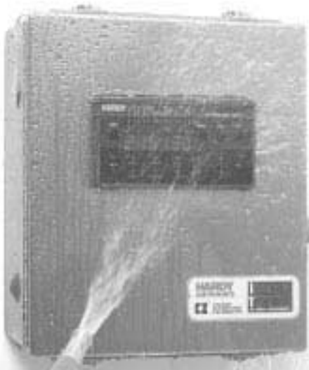
HI 2151/30WC – WS Wall Mount Unit. All versions have waterproof key pads / display