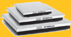
ANY-WEIGH ® Scales