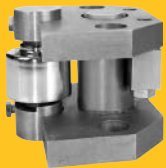
ADVANTAGE Series Load Point with C2 ® Calibration

Hardy Instruments carries a wide variety of strain gauge load points and scale bases to accommodate your applications requirements