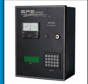
Mold Level & Strip Guiding Measurement & Control Systems for Metals/Steel Industries