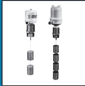
Liquid Level Switches