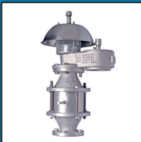
Tank Vents, Flame and Detonation Arresters, Fittings & FRP Equipment