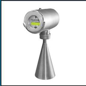
Liquid Level Gauging, Temperature Detection & Inventory Management