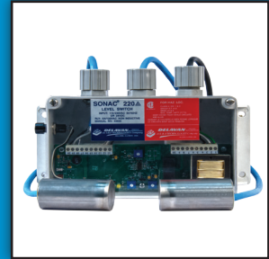
Point/Multi-Point Level Controls & Continuous Level Sensors