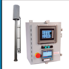
Digester Gas Equipment Waste Gas Burners