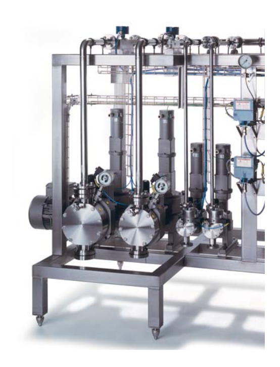
LEWA gradient mixer with precise stroke adjustment for high-pressure liquid chromatography (100 bar)

The different downstream processes are increasingly taking a key role in the production of pharmaceutical and bio-technological products and fine chemicals. For years LEWA has supplied metering pumps and metering systems for chromatographic separation processes on an industrial scale. These pumps and systems have proven excellently due to the precise, reproducible metering accuracy, the wide adjusting range and the high product quality. Among others they are used for the following processes: