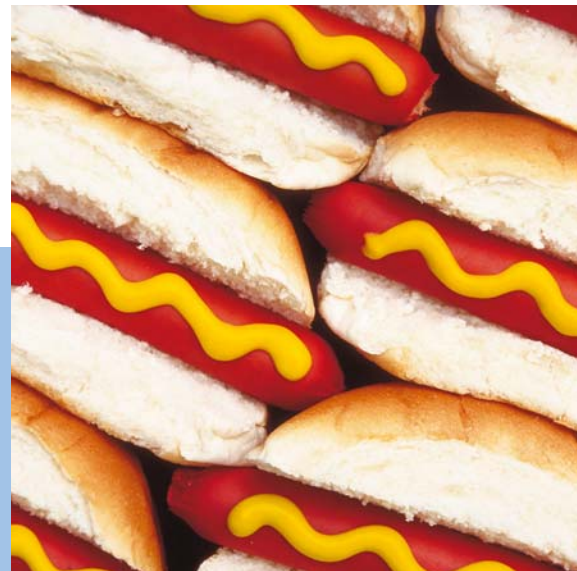
Transfer of mustard and other viscous products.