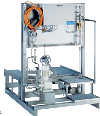
LEWA pumps have many configurations that run the range from simple metering to skids for introducing micro-ingredients.

Extensive documentation is a matter of course at LEWA. Included with the operating manuals are technical data sheets, cross-sectional drawings, material traceability and wear and spare parts lists. Test reports, pressure tests and output diagrams are available as options.