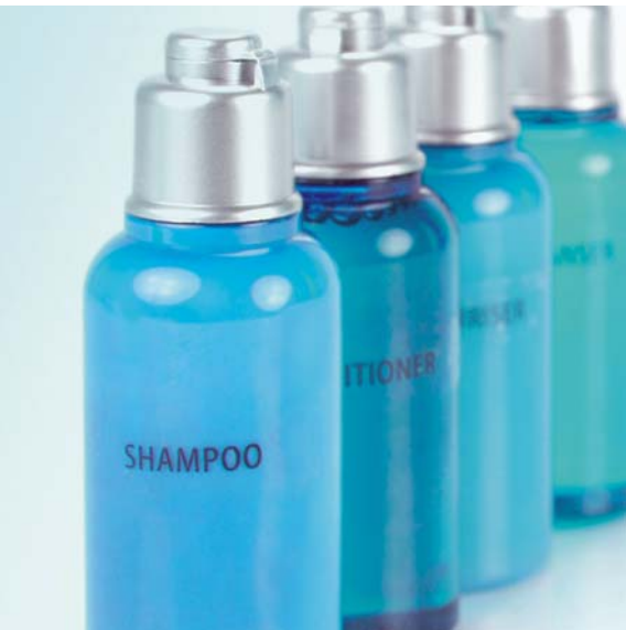
Proportional blending of liquid ingredients.