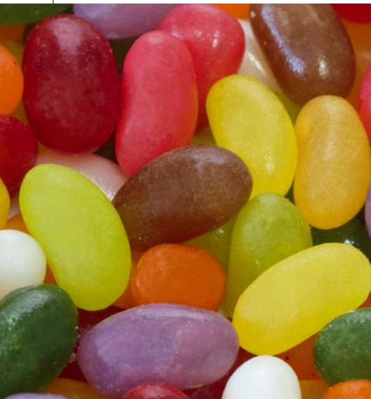
One pump for many applications: Production of jellied sweets.