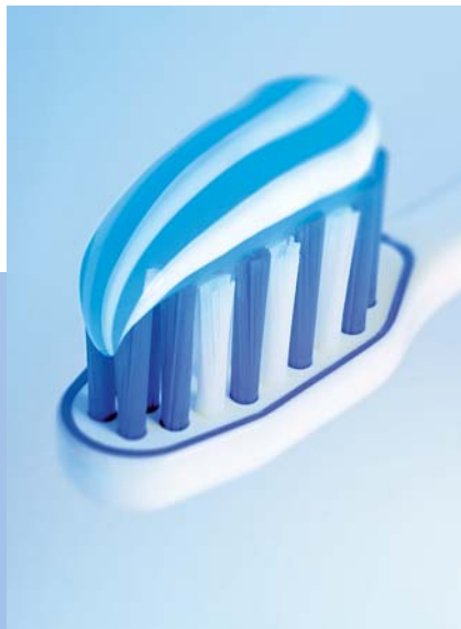
Metering of colours, flavours, or preservatives.