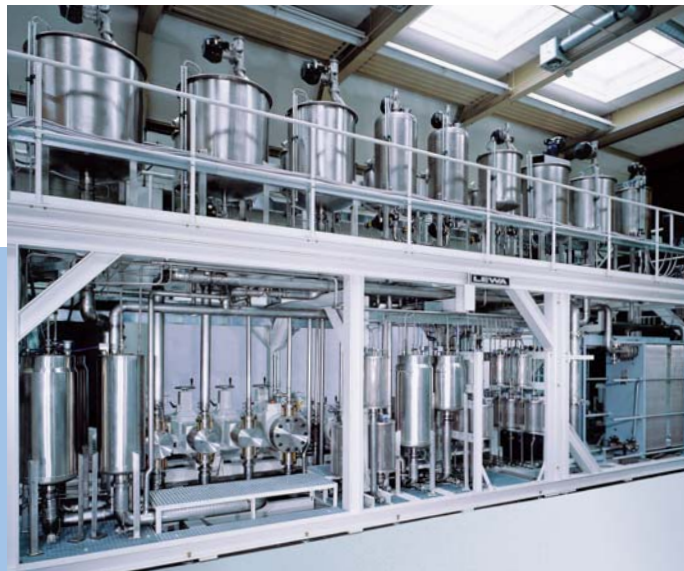
Complex systems for proportional blending or transfer of multiple product streams