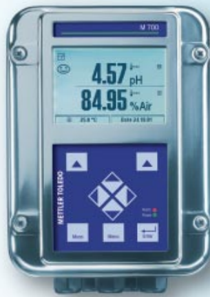
Multiparameter transmitter M 700