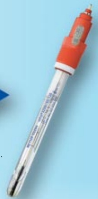
Digital ISM sensor

Safe and fast: Data exchange via digital IEEE communication protocol.